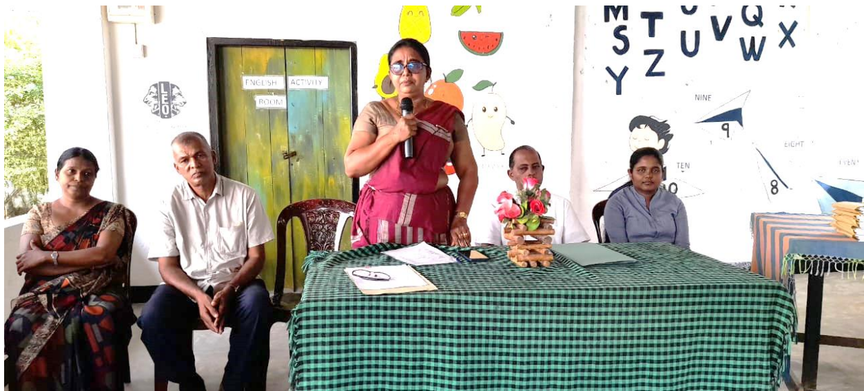
The Principal addressing the Gathering