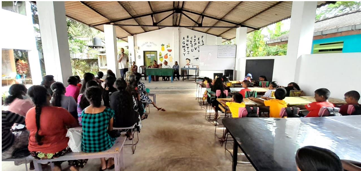
Students' Parents at the Briefing Event